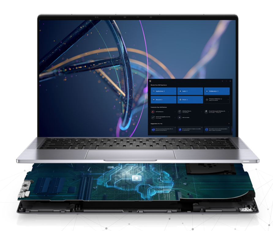
Click here to watch the video to see how it works!

Dell Optimizer is our Al-based optimization software that learns and responds to the way you work, designed to automatically improve application and device performance, PC and accessory battery run-time, audio/video settings and privacy – all in the background while you're working.